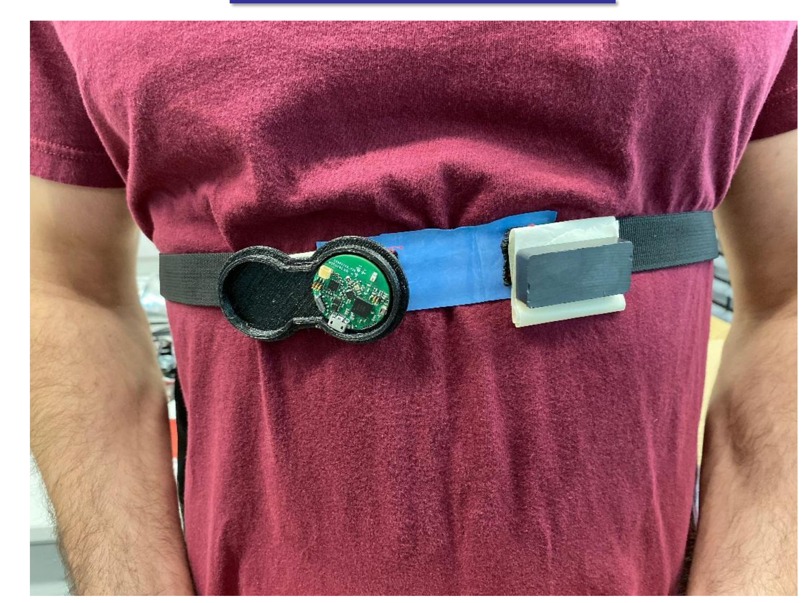
Above, you will see a theoretical prototype of our respiratory belt, incorporating the hardware on the left, as well as a magnet on the right.